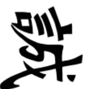
Figure 2. Japanese Makoto Symbol